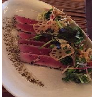
Ahi Tuna Carpaccio

Make plans for your Family and Office Holiday Parties!