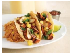
Anchote Chicken Tacos

220 Indian River Road Orange, CT 06477 203.687.4300