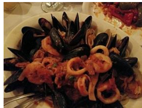
Seafood Fra Diavolo

577 Franklin Avenue Hartford CT 06114 860.296.3238