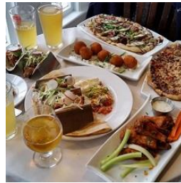
Happy Hour at Abigail's

4 Hartford Road Simsbury, CT 06089 (860)264-1580