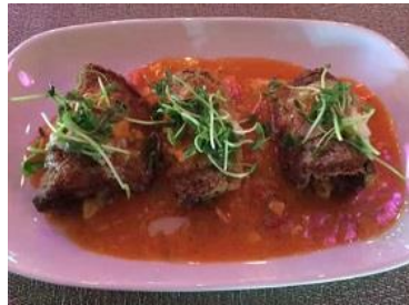
Eggplant Rollantini with Vegetables

600 Cold Spring Road Rocky Hill, CT 06067 (860) 563 – 7000