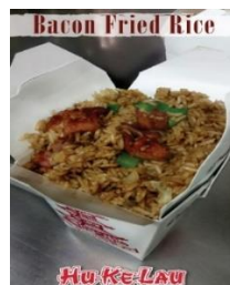
Bacon Fried Rice

705 Memorial Drive Chicopee, MA 01020 413.593.5222