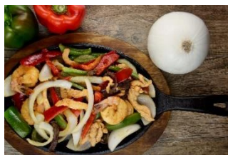
One of the many fajitas they have to offer

Appetizers Mexican Plates Enchiladas and more Burritos, Sides and Salsas Beverages