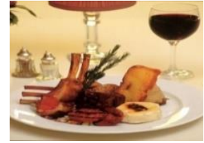
Dinner is served

55 Lee Road Lenox, MA 01124 413.637.1364 877.990.1715