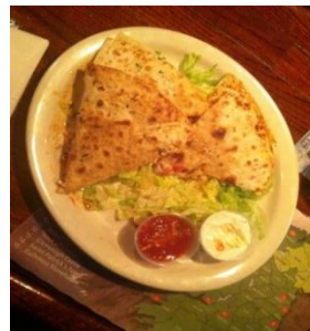
Buffalo Chicken Quesadilla

Patio is Open! Mon - Thurs Serving Half price apps (excluding the trio) 2 - 4:30 pm