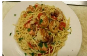
Shrimp and Scallop Scampi