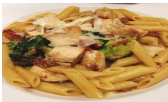
Tuscan Chicken Pasta

1068 Riverdale Road West Springfield, MA 01089 413.827.9353