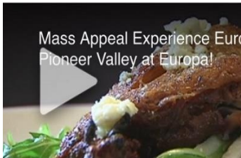
Mass Appeal Experience Euro Pioneer Valley at Europa!

782 Center Street Ludlow, MA 01056 413.547.6443