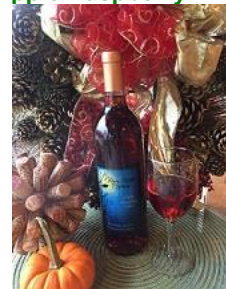
Apple Raspberry Flirt