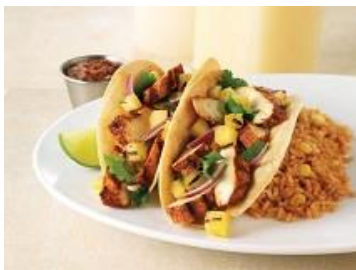
Anchoite Chicken Tacos

33 Border Way West Springfield, MA 01089 413.304.3500 19 Commerce Way Woburn, MA 01801 781.995.2314