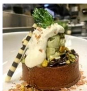
Chocolate marscapone tart with pistachio gelato and sea salt

135 Cooper St. Agawam, MA 01001 413.789.1267