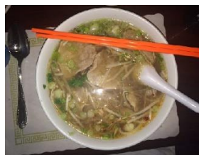
Beef, meatball and brisket pho