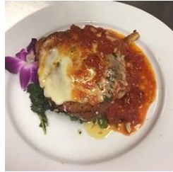
Stuffed pork chop over broccoli rabe pepper jack cheese and plum tomatoes

45 Washington Street Westfield, MA 01085 413.642.3221