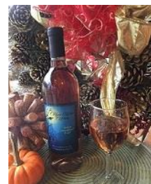
Apple Cranberry Flirt

Remember, Holidays are coming... Wine makes a wonderful gift! For the Holidays we have two new wines >>>