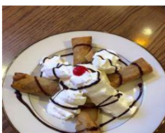
Be sure to save room for dessert