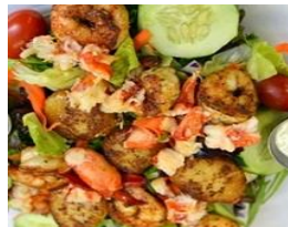
mmm... mmm... seafood

1305 Memorial Avenue West Springfield, MA 01089 413.732.4188