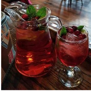
How about some Jingle Juice?

28 Depot Street Palmer, MA 01069 413.283.2744