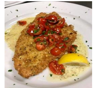
Pistacchio and panko-crusted sole