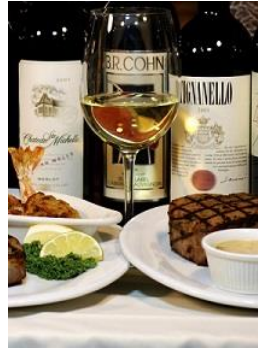
A little Variety!!

Banquet room is available For private functions