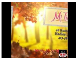
click for video

NEW Hours Closed Monday Sun – Wed 11 am - 9 pm Thurs – Sat. 11 am - 10 pm