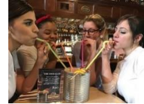
This one is call the DERAILER

Accepting orders for Our Whiskey Bread Pudding