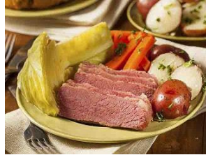
Corned Beef and Cabbage

Céad Míle Fáilte! (A hundred thousand welcomes)