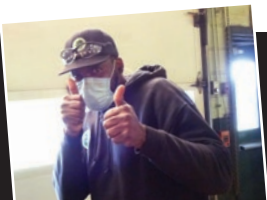
COVID-19 Practices (PAGES 4–5)