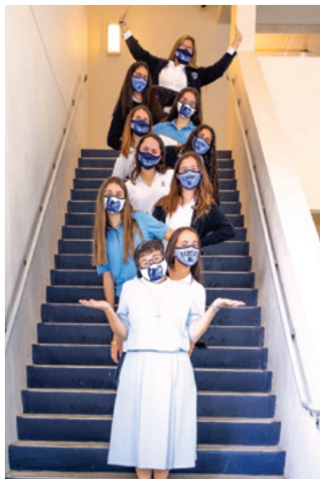
Bobcat pride! Sister poses with the Bobcat ambassadors of Our Lady of Lourdes Academy who give tours of the school for prospective families.