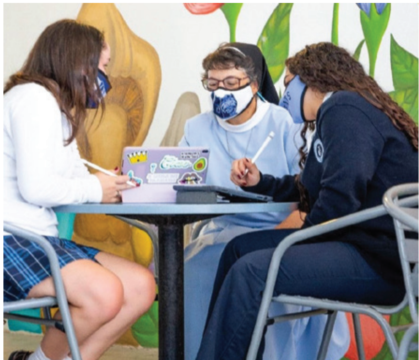
Sister works with students on their college applications as they prepare for their future after high school.