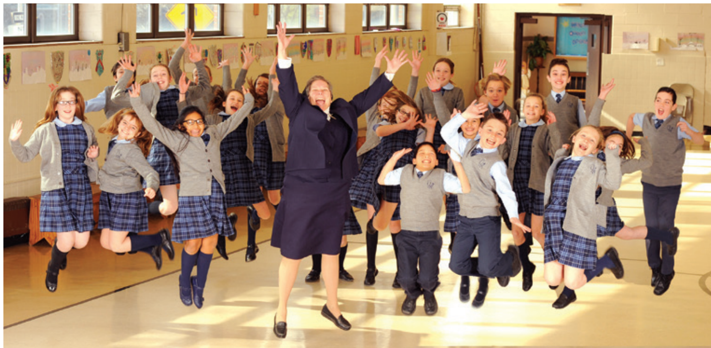
Jumping for joy with the fifth grade class at Queen of Angels Regional Catholic School in Willow Grove, PA.

joy. Her advice is to “live with the Lord and value each day because we never know what tomorrow has in store for us, our family, or our friends.” It appears that those who influenced her vocation many years ago, knew what was best. “It is a lot of fun being a nun,” Sister says. Her advice for others? “Come join us!”