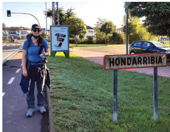
Let the journey begin!

pilgrimage to heal from my grief, but the timing never seemed right. As my Silver Jubilee in religious life approached in 2020, I felt the call to walk again, this time in thanksgiving for my vocation, my parents, and for my own personal intentions.