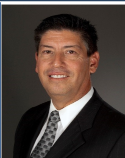
ASQLA Chair's message for September 2018 Newsletter