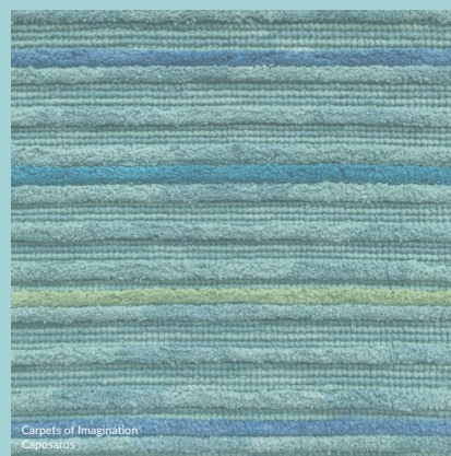
Carpets of Imagination Caposairos