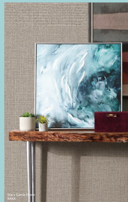
Stacy Garcia Home IMAX