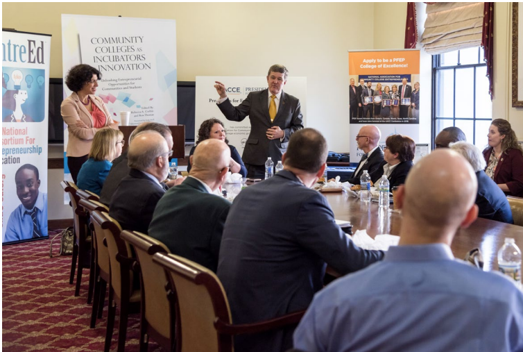
January 28, 2019 – Governor Jim Justice's office (WV)