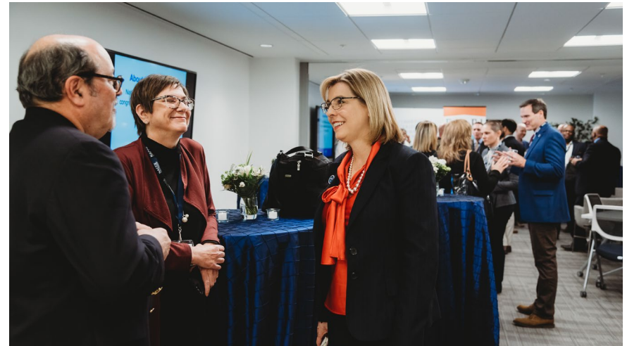
February 19, 2019 – ACCT offices (Washington, DC)