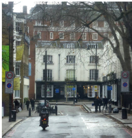
Tiny Duke's Road was to be the only entry point from the north BUT this is now also being closed – see below.

* BREAKING NEWS: Duke's Road, together with Upper Woburn Place, is now also to be closed to westbound traffic on Euston Road, removing the last remaining entry point from the north to this area. This information is buried in the legal notices on page 30 of the CNJ of 18.6.20. Reason given: 'to introduce social distancing measures...'