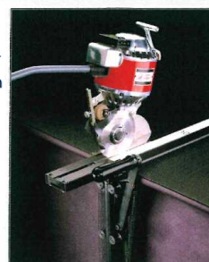
Heavy Duty Falcon 548 (Model 548 FALHD)