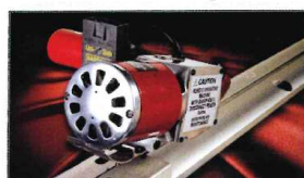
Auto Track Falcon II (Model ATFII)