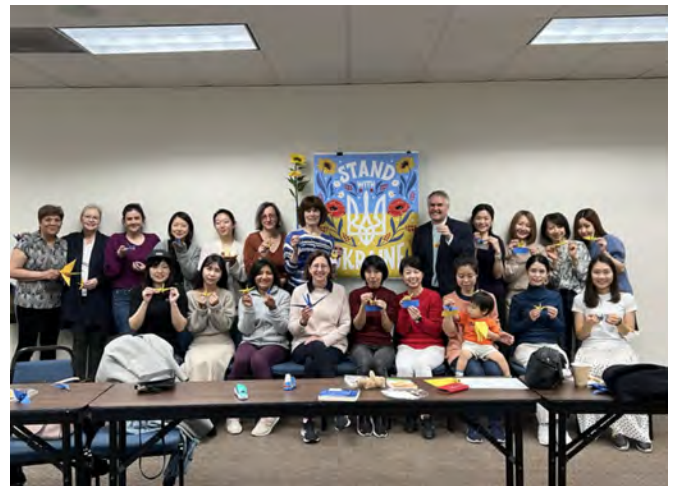
Mural and Origami Birds from ESL Student Showing Support for Ukraine