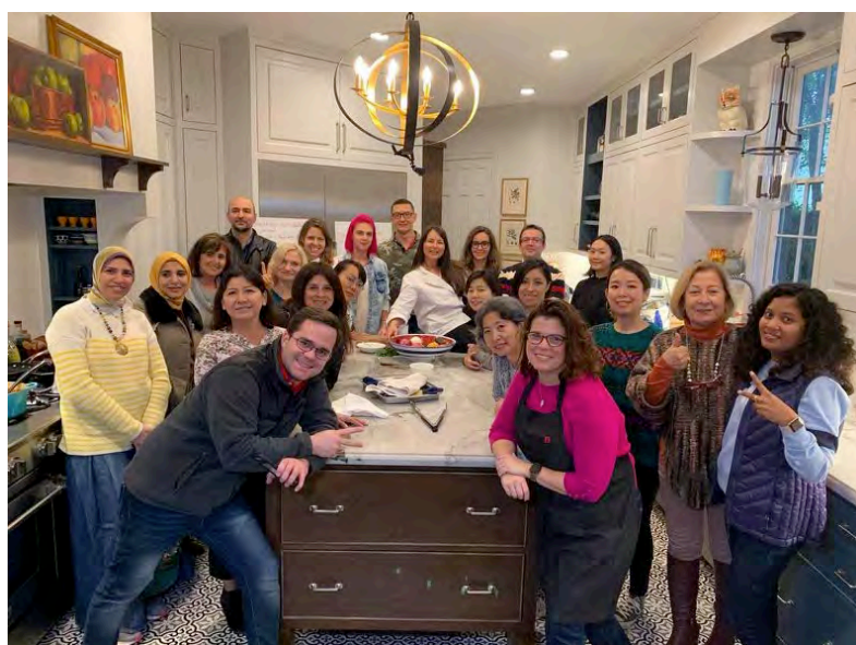
Student Fellowship in Homes