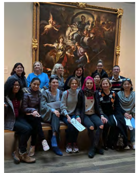
ESL Field Trip to Local Art Museum

Through these activities, students not only improve their English speaking, listening and writing, but also build fellowship and learn about one another's cultures and perspectives.