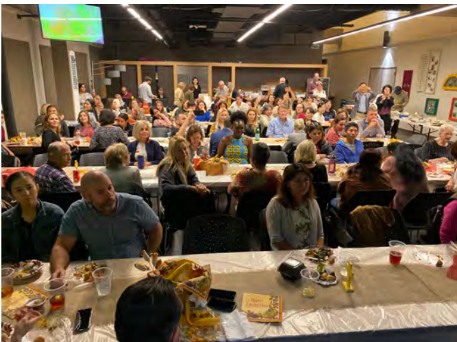
ESL Thanksgiving Potluck