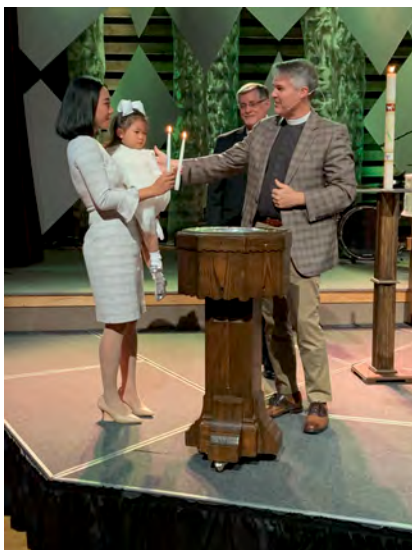
Baptism of ESL Chinese Student and Her Daughter

While not forced on them, many students grow curious in learning about Christianity, join the church and often give their life to the Lord. Just in the last three years, the program has seen many adult baptisms of new members from countries such as China, Russia, Japan, and Turkey.