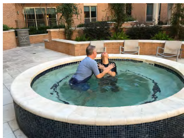
Baptism of ESL Student from Turkey