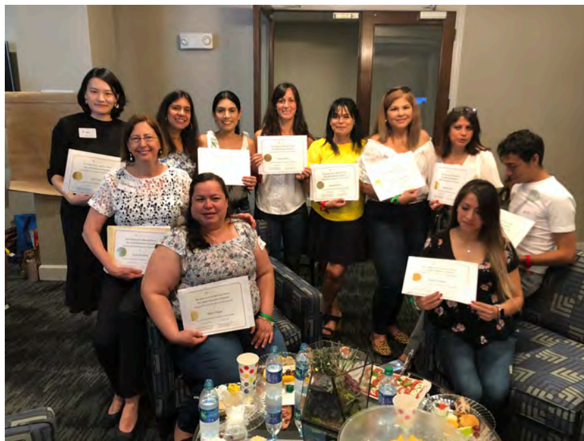
ESL Graduates Receiving Certificates of Completion