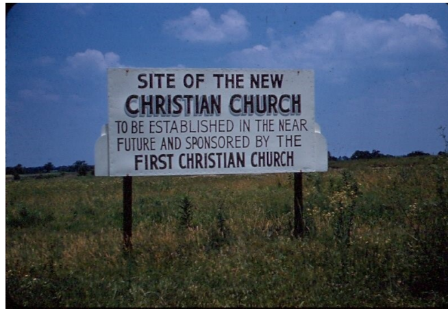
The Broadway Vision in 1958...What Is It in 2020?