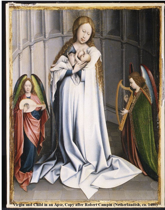
Virgin and Child in an Apse, Copy after Robert Campin (Netherlandish, ca. 1480)

Friday, December 19, 2025, 6:30 pm Christ Church Woodbury, New Jersey A Parish in the Diocese of New Jersey