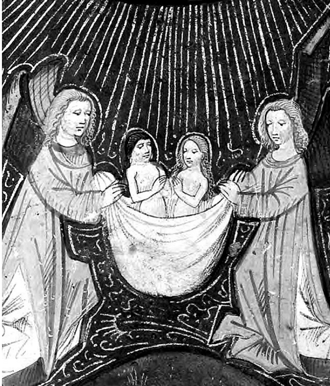
Souls Being Carried Up to Heaven, artist unknown

Christ Church Woodbury, New Jersey A Parish in the Diocese of New Jersey