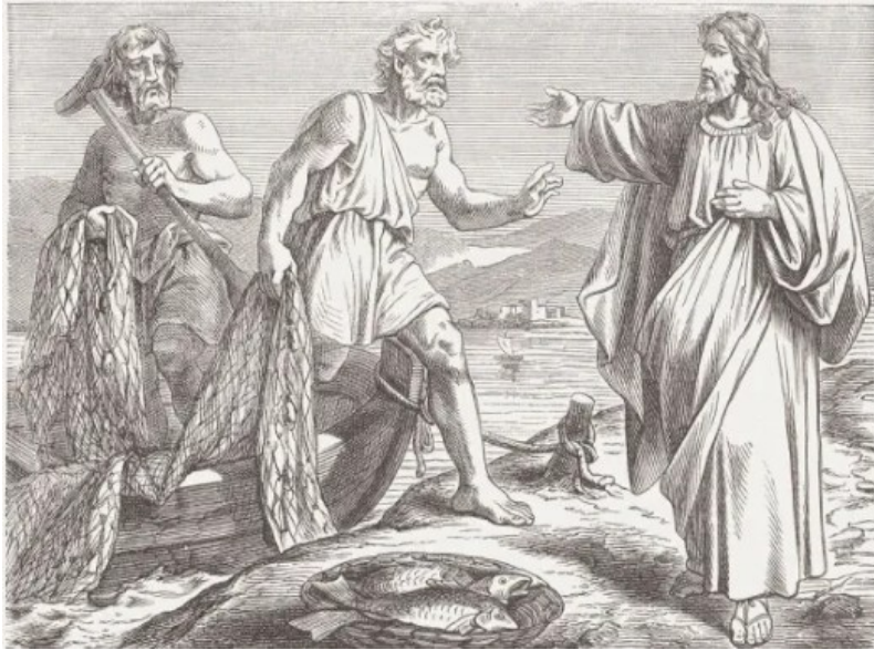
Jesus Calls Peter and Andrew Woodcut Print, 1877