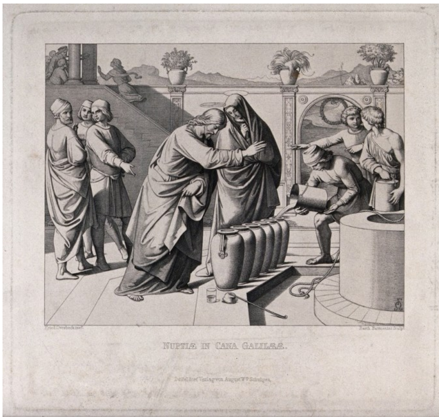
Christ makes wine out of water at the marriage at Cana, B. Bertocchini (1848)