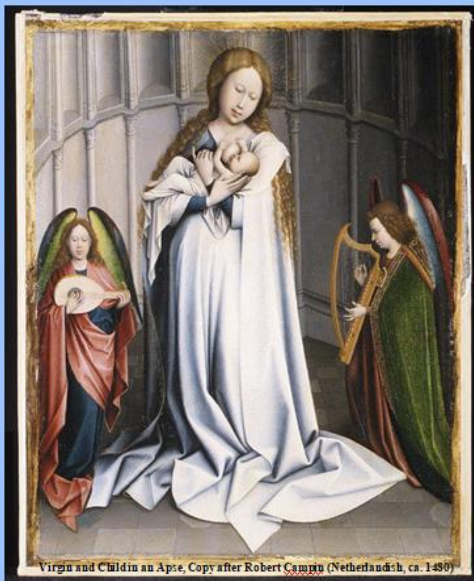
Virgin and Child in an Apse, Copy after Robert Campin (Netherlandish, ca. 1490)

Friday, December 19th at 6:30 in the evening