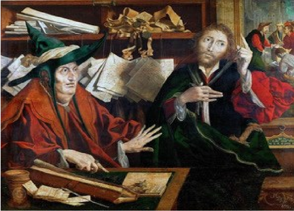
Marinus van Reymerswaele, The Unjust Steward (1430).

Christ Church Woodbury, New Jersey A Parish in the Diocese of New Jersey