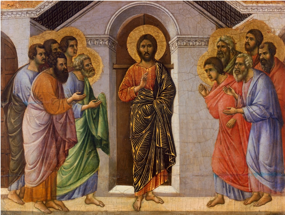
Maestà "Christ Appearing to the Apostles, Duccio DiBuoninsegna