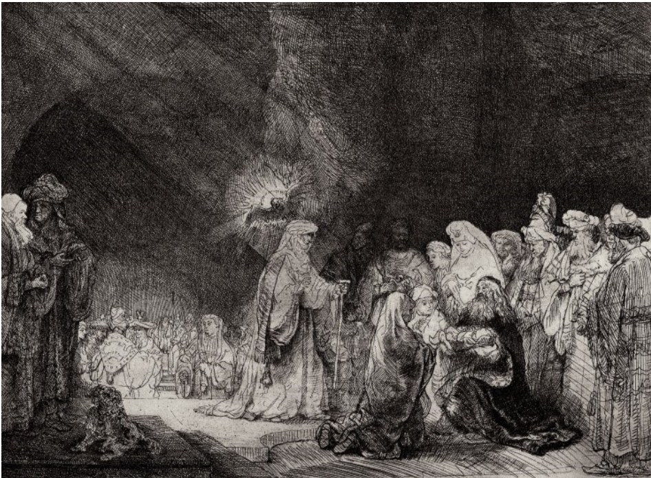
The Presentation of Jesus at the Temple, Rembrandt (1606-1669)