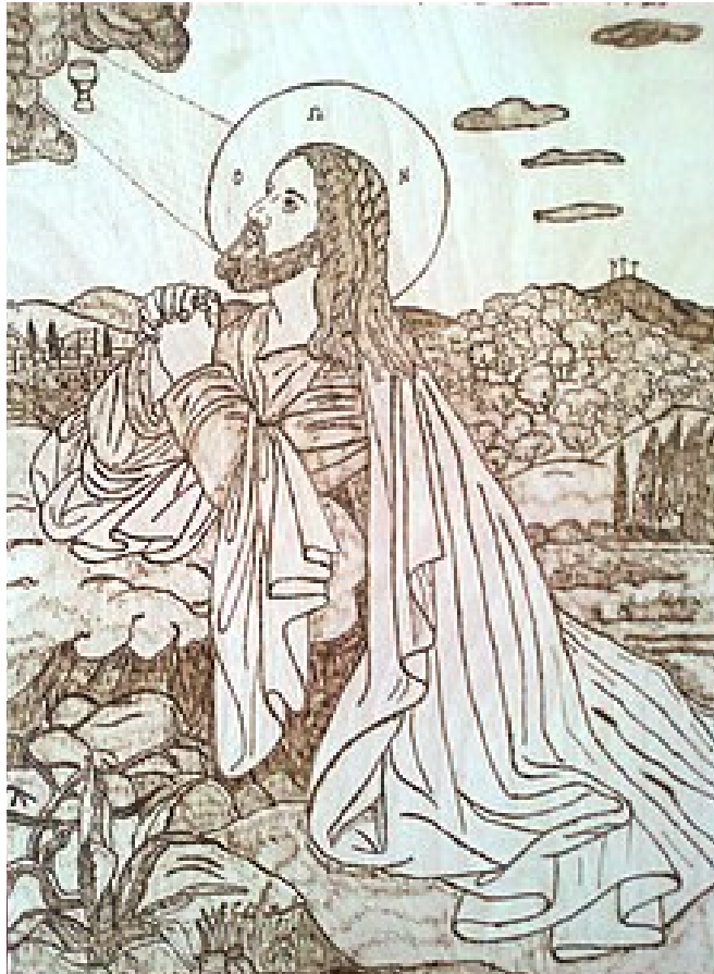
Image of Jesus. Created using the pyrography technique.