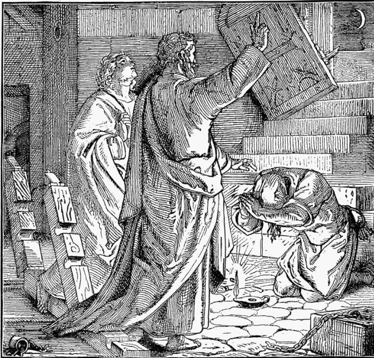
THE JAILER CRIES, WHAT MUST I DO TO BE SAVED?

St Paul & his Jailer after the Earthquake, American (1884)