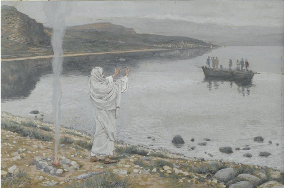
Christ Appears on the Shore of Lake Tiberias by James Tissot (1886)

Christ Church Woodbury, New Jersey A Parish in the Diocese of New Jersey 8:00 AM & 10:00 AM