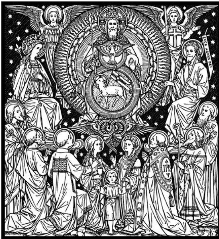
The Holy Trinity - Artist Unknown