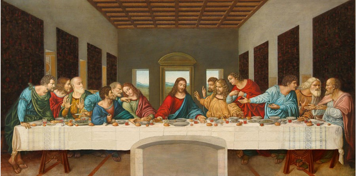
The Last Supper - Leonardo da Vinci (1452-1519)