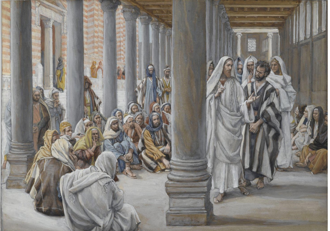
Jesus Walks in the Portico of Solomon - James Tissot (1836-1902)