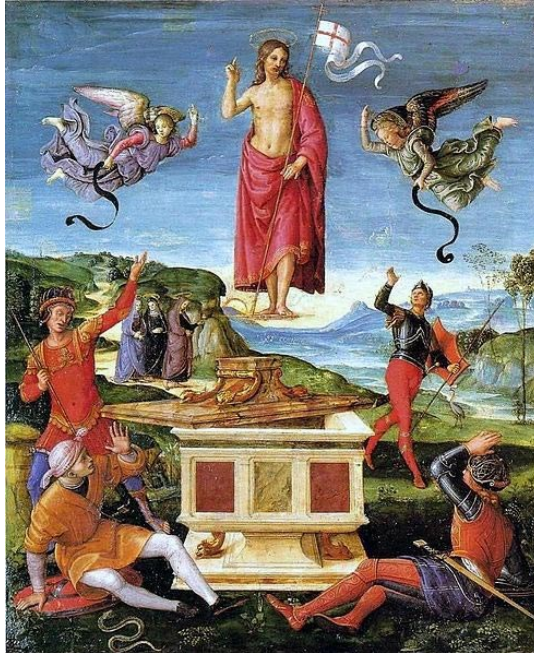
The Incredulity of Saint Thomas by Caravaggio (1602)