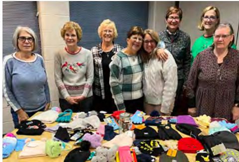
Every year since 2013, the Wings group at St. Bavo's Parish has celebrated the Christmas season by donating hats and mittens for CCS.

School clothing drives, boot collections at churches and individuals dropping off bags of outgrown clothing all make the work of CCS possible.