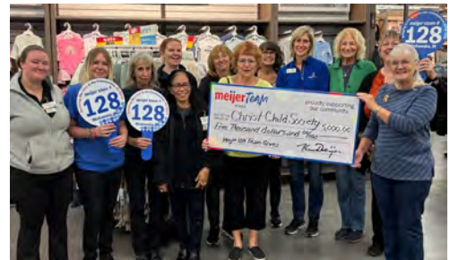
In October, Meijer store 128 donated $5,000 to support CCS's Clothing Program.