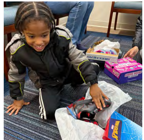
Superman shoes are a big hit!