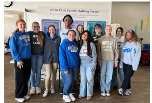
Marian High School students prepared art kits for the National CCS United in Service project.