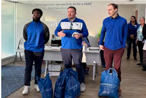
Tradehome Shoes at University Park Mall chooses a charity each month to be the recipient of new socks. The store donated a package of socks to The Christ Child Society for every package purchased during September.

A woman dropped off a Christmas gift bag containing toys from her 5-year-old. She had told him no new toys until he gave some to a child in need! She says it's going to be a new tradition.