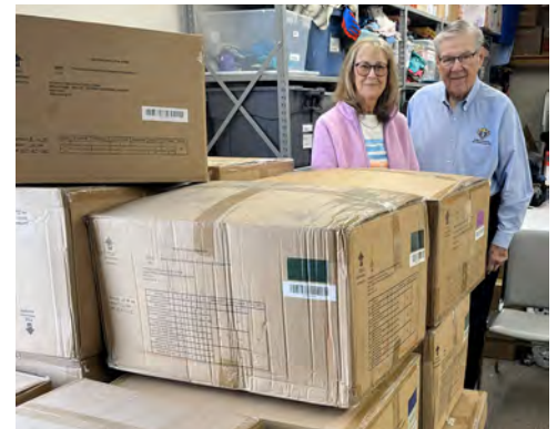
The Santa Maria Council - Knights of Columbus donated 16 boxes of new coats.

A couple years ago, a Girl Scout troop 'adopted' Foster Hope to earn a special charity badge. They collected many new and used items and cash donations. One of those girls still comes back with donations.