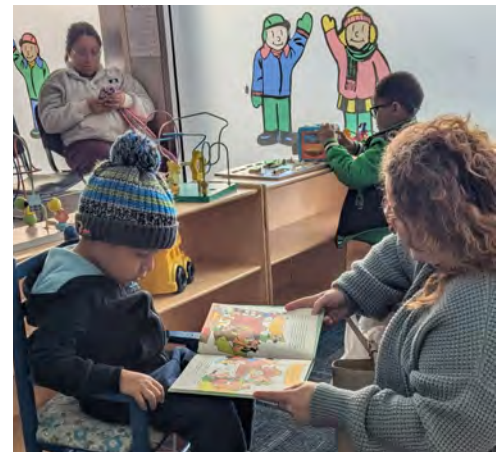
A mother reads to her child who received a book in the Book for a Child Program at the Center.