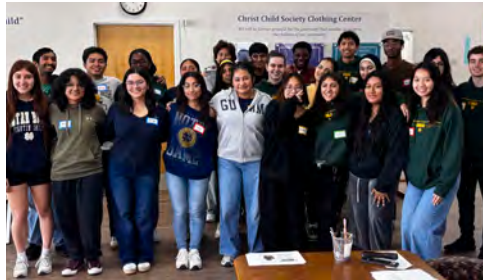
Volunteers from the University of Notre Dame's Balour-Hesburgh Scholars Program helped stock shelves and lift boxes.