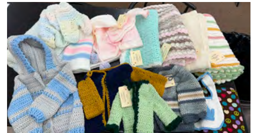
The Francis Branch of the St. Joseph County Public Library has set aside money to purchase yarn for its Knitting/Crocheting Group to use for making baby sweaters and blankets as well as children's hats and mittens for CCS.