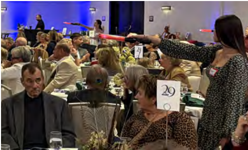
Marian High School students highlight donors who raise their paddles during Bids 4 Kids at Let Love Shine.