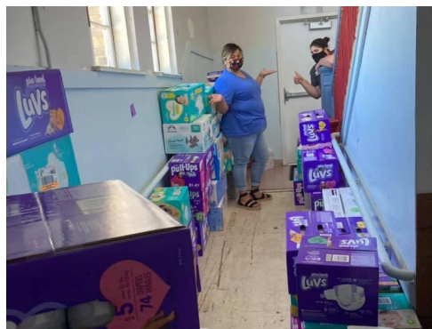
El Campito staff was delighted with the diapers they received for the children in their preschool.

Experience the satisfaction and fun of active membership!