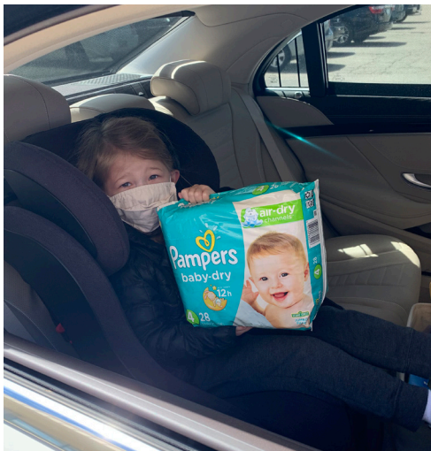
The littlest diaper donor