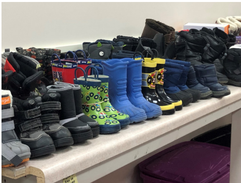
Thanks to parish members and students who donated boots to keep little feet warm next winter.