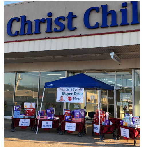
The Diaper Drop is ready to start!