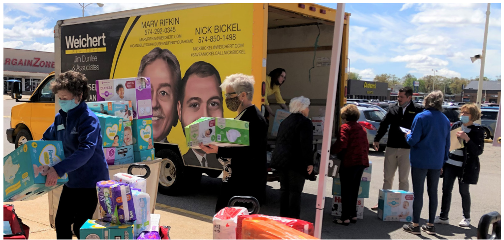
The Weichert Realty Team unloads a great donation of nearly 6,000 diapers.