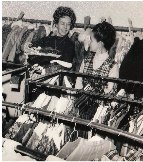
The Clothing Room in Sacred Heart School, 1960.