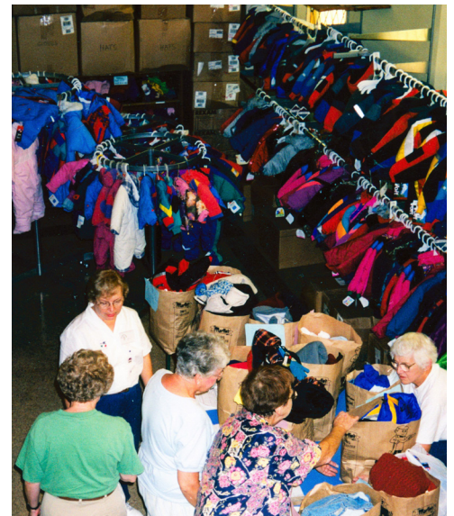
The controlled chaos of Thomas Street.