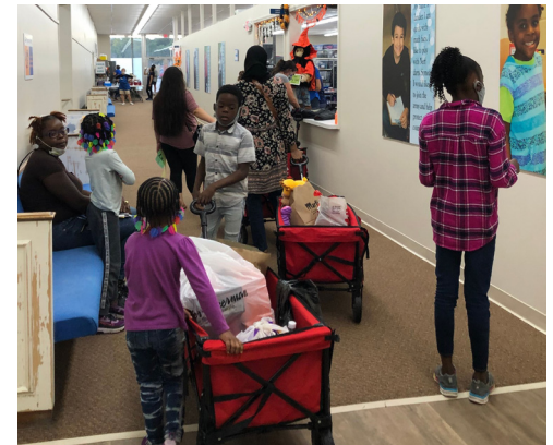
Clients fill the bright hallways in the new Clothing Center.