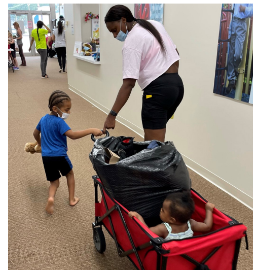
Mom's little helper pulls one of the red wagons. First purchased to help the CCS volunteers last year when they collected all the clothes, the wagons have been repurposed to make 'shopping' easier for clients with several children.