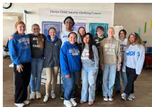
Marian High School students prepared art kits for the National CCS United in Service project.