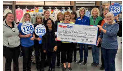
In October, Meijer store 128 donated $5,000 to support CCS's Clothing Program.