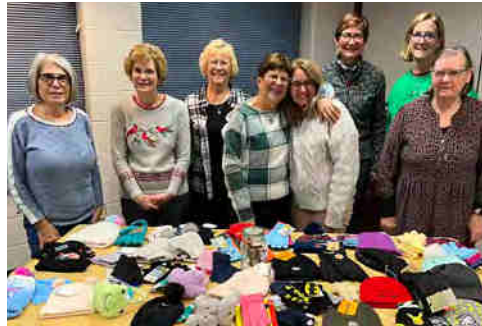
Every year since 2013, the Wings group at St. Bavo's Parish has celebrated the Christmas season by donating hats and mittens for CCS.

School clothing drives, boot collections at churches and individuals dropping off bags of outgrown clothing all make the work of CCS possible.