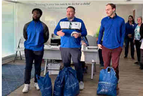
Tradehome Shoes at University Park Mall chooses a charity each month to be the recipient of new socks. The store donated a package of socks to The Christ Child Society for every package purchased during September.

A woman dropped off a Christmas gift bag containing toys from her 5-year-old. She had told him no new toys until he gave some to a child in need! She says it's going to be a new tradition.