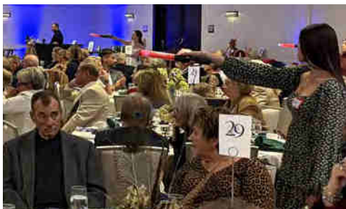
Marian High School students highlight donors who raise their paddles during Bids 4 Kids at Let Love Shine.