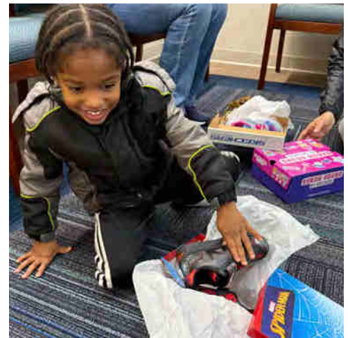
Superman shoes are a big hit!