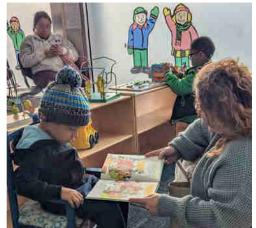
A mother reads to her child who received a book in the Book for a Child Program at the Center.