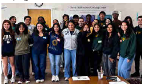
Volunteers from the University of Notre Dame's Balour-Hesburgh Scholars Program helped stock shelves and lift boxes.