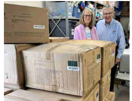
The Santa Maria Council - Knights of Columbus donated 16 boxes of new coats.

A couple years ago, a Girl Scout troop 'adopted' Foster Hope to earn a special charity badge. They collected many new and used items and cash donations. One of those girls still comes back with donations.