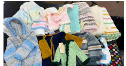
The Francis Branch of the St. Joseph County Public Library has set aside money to purchase yarn for its Knitting/Crocheting Group to use for making baby sweaters and blankets as well as children's hats and mittens for CCS.