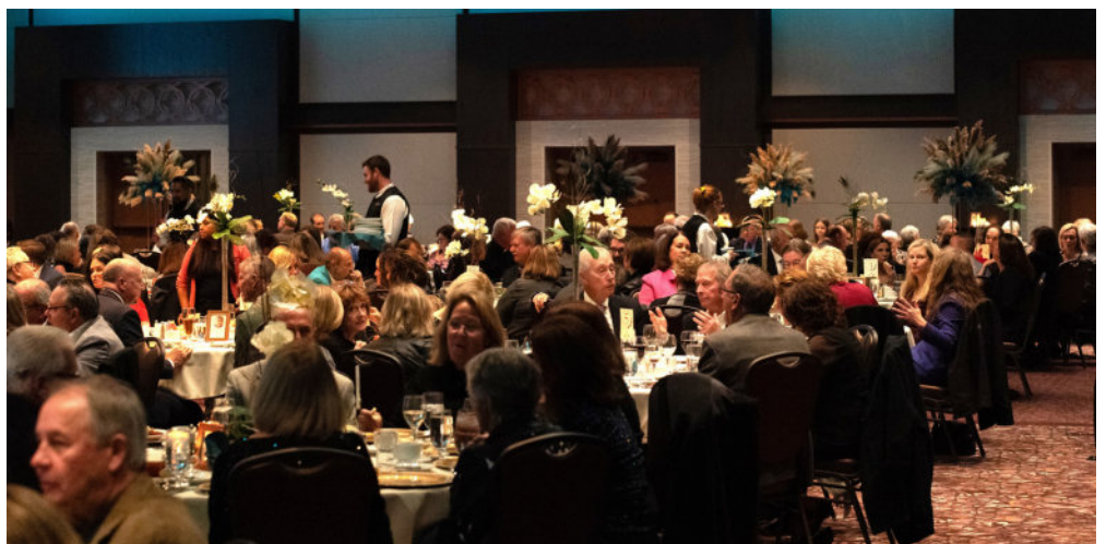
The generous crowd enjoyed delicious food, good company and fun entertainment while the stunning table decorations set a festive mood.