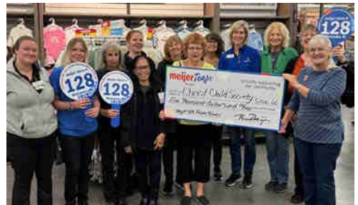
In October, Meijer store 128 donated $5,000 to support CCS's Clothing Program.