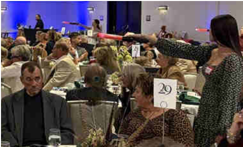
Marian High School students highlight donors who raise their paddles during Bids 4 Kids at Let Love Shine.