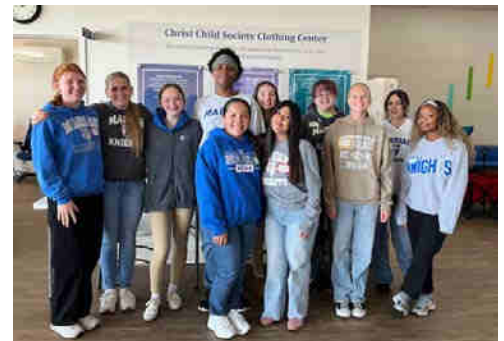
Marian High School students prepared art kits for the National CCS United in Service project.