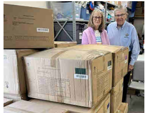
The Santa Maria Council - Knights of Columbus donated 16 boxes of new coats.

A couple years ago, a Girl Scout troop 'adopted' Foster Hope to earn a special charity badge. They collected many new and used items and cash donations. One of those girls still comes back with donations.