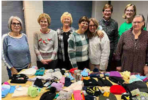
Every year since 2013, the Wings group at St. Bavo's Parish has celebrated the Christmas season by donating hats and mittens for CCS.

School clothing drives, boot collections at churches and individuals dropping off bags of outgrown clothing all make the work of CCS possible.