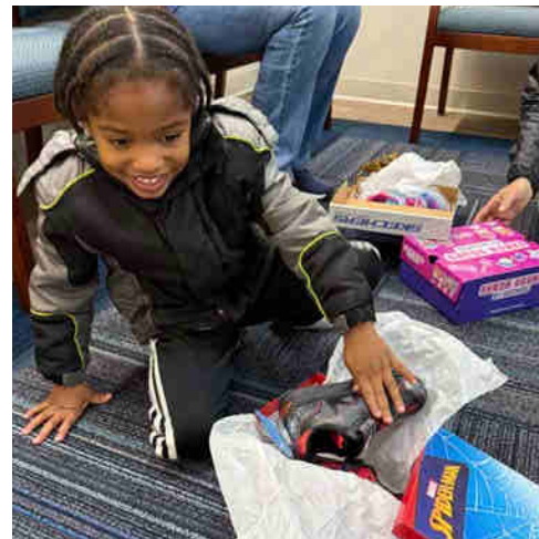
Superman shoes are a big hit!