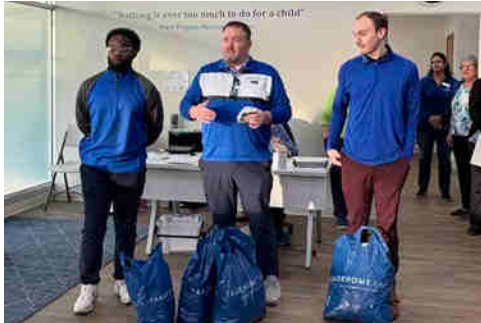
Tradehome Shoes at University Park Mall chooses a charity each month to be the recipient of new socks. The store donated a package of socks to The Christ Child Society for every package purchased during September.

A woman dropped off a Christmas gift bag containing toys from her 5-year-old. She had told him no new toys until he gave some to a child in need! She says it's going to be a new tradition.