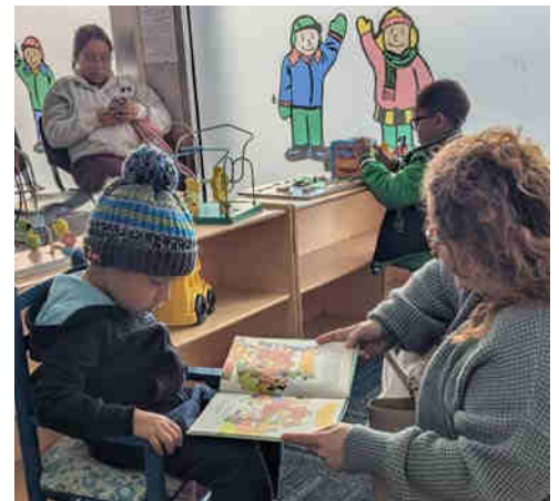
A mother reads to her child who received a book in the Book for a Child Program at the Center.