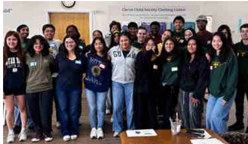
Volunteers from the University of Notre Dame's Balour-Hesburgh Scholars Program helped stock shelves and lift boxes.