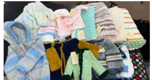
The Francis Branch of the St. Joseph County Public Library has set aside money to purchase yarn for its Knitting/Crocheting Group to use for making baby sweaters and blankets as well as children's hats and mittens for CCS.