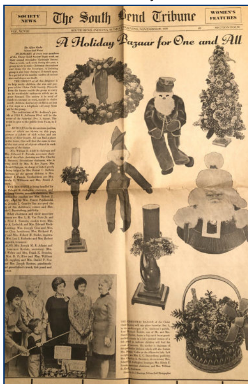
CCS Bazaars were frequent features in the South Bend Tribune.