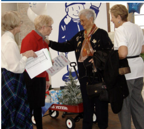
A Red Wagon welcome in 2007.