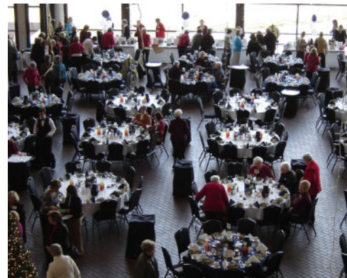
Holiday Luncheon 2007.

The first luncheon was held at Windsor Park Conference Center and featured a Talbot's fashion show, silent auction items and a raffle. Later, the location moved to Century Center and crowds neared 500 members and their quests.