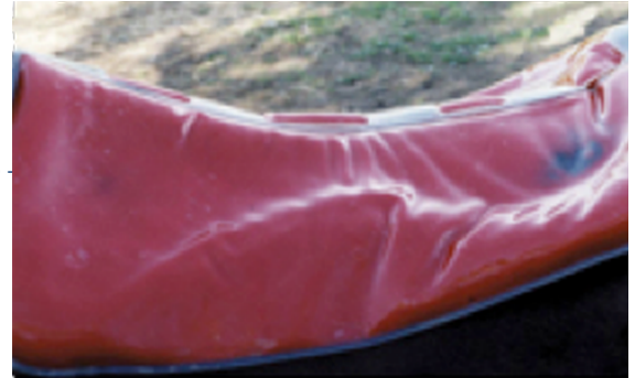
Port Lewis Impression Pad

It's still a matter of working with someone who knows what they're doing to ensure proper saddle fit for you and your horse – regardless of the devices that are available to make this 'easier'. There are no