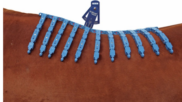
The Topographer by Equi Scan - also used to measure the 3-D back shape but somewhat awkward in its usage.

There are a couple of other devices available commercially (only in Europe at this point) to ascertain the shape of the horse's back, but they can be somewhat convoluted and unwieldy with several kinks to be worked out before they become truly acceptable for general use. The Topographer® by EquiScan consists of 11 individually moving sectioned arms which are laid across the horse's back. Each individual number on each segment is recorded. Until this can be done automatically or electronically it becomes prohibitive (time-wise) to do this – although the results are very good. Many more saddle manufacturers are starting to use this tool as it is one of the most comprehensively accurate on the market.