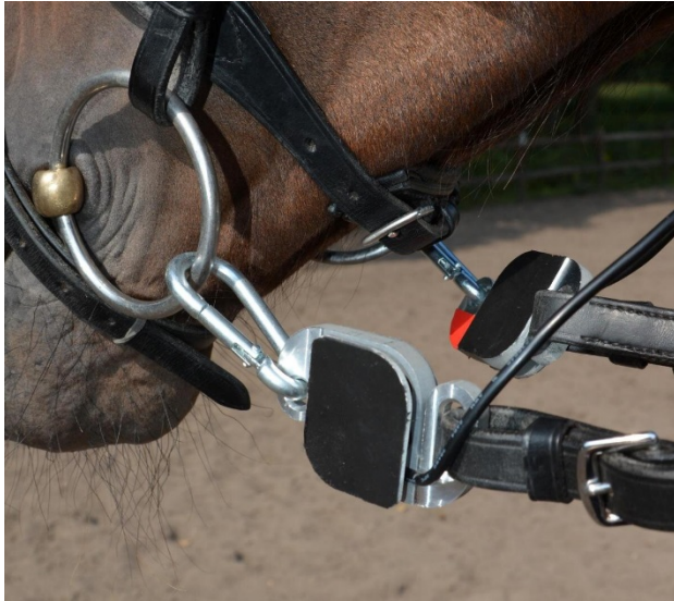
Rein Tension Device -