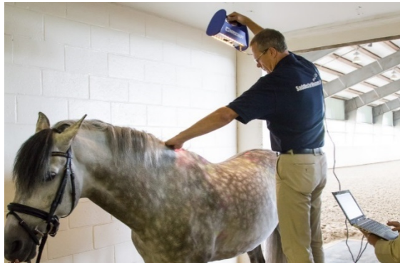
The HorseShape® laser captures the 3-Dimensional back shape with a computer printout that can be compared over time as the horse changes – photo used with permission.

Several of these tools can be subjectively manipulated so that in the wrong hands they become simply a marketing tool to show you exactly what the technician wants you to see. Thermography is one of these tools which can provide a very pretty picture filled with lots of colours, but the interpretation is open to error unless you have someone well-trained in the use of the instrument. Computerized saddle pads to measure pressure points – integrating sensors in every square inch of the pad that are linked to a computer readout – are also not without fault, as pressure will change according to the gait and rider balance.