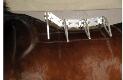
The Arc Device (or "lobster claw") also measures the angulation all along the back.

The Arc Device™ is a manual measuring device, fitted to each individual horse's back while the saddle fitter or saddle ergonomist records the angles. This is also used to ensure that a saddle is refitted properly to accommodate the horse's back shape.