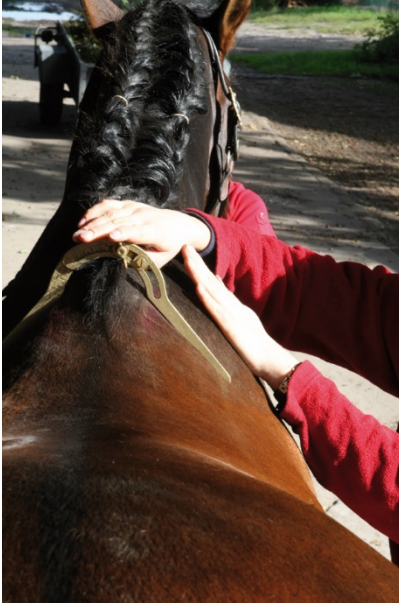
Using the Sprenger Gauge to measure wither angle and ensuring the shoulder angle lines up with Sprenger Gauge.

For most saddle evaluations we do, we prefer the simple Sprenger Withers Gauge to determine withers shape and angle to ensure enough room at the pommel of the saddle, and a combination of the Arc Device, an LWT (leather withers tracer) and the HorseShape® Laser (if the client asks) to determine the actual accurate three dimensional shape of the horse's back and the saddle support area.