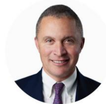
Harold Ford, Jr.

Former U.S. Congressman; alliantgroup Senior Vice President