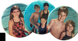
Free with every package: 3" Photo Buttons