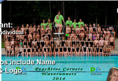
Team Photos include Name & Logo