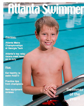
Swim Magazine Cover