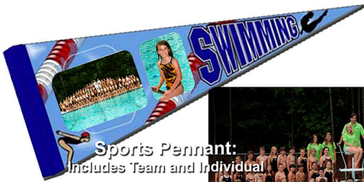
Sports Pennant: Includes Team and Individual