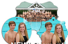
NEW! Ornaments Choose from 3 different designs