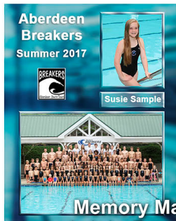
Memory Mate Includes Team and Individual images com- bined with Name and