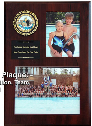
Medallion Memory Plaque: Solid Wood, Swim Medallion, Team and Individual