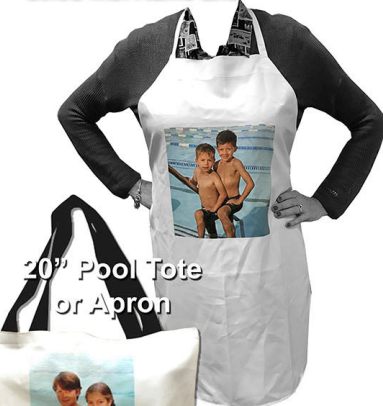
20" Pool Tote or Apron