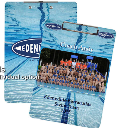
Clipboards Available in team and individual option