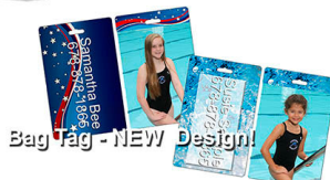
Bag Tag - NEW Design