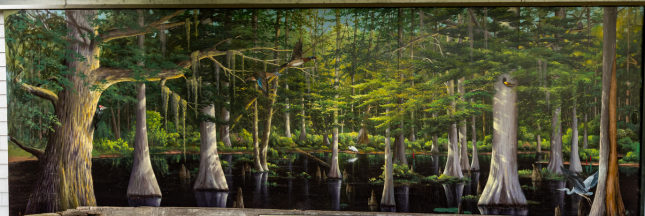
Mural of bottomland forest ecosystem painted by Mike Bennett.

We can accommodate groups as large as 40 students! Our museum operates from Tuesday through Friday for group visits, with a scheduled start time at 10:00am. To schedule your group's next visit to the Roanoke/Cashie River Center, call us at 252-794-2001.