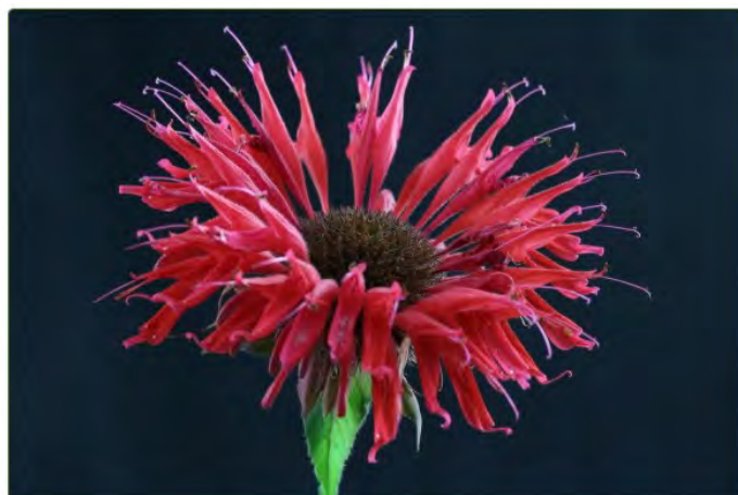
Bee Balm ( Monarda didyma 'Jacob Cline')