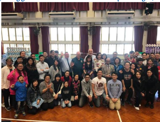
Judges and Exhibitors at the Felidae Beyond Infinity CFA cat show.