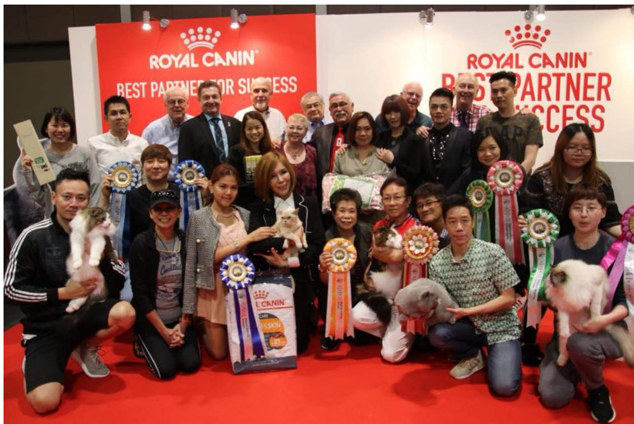
Judges, Show Committee and Top Winners