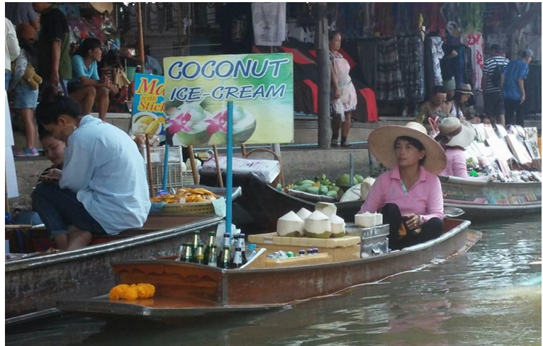
Seen during a boat tour of the local floating mall

The layout of the showhall was not unusual for Asia but is not at all typical of shows in the USA. The cats and judging rings are behind a waist-high wall and the spectators are on the outside of that short wall. The judging rings face that wall so the gate can watch the judging but they can not easily see the cats in the benching area. Typical of our shows in Asia, most of the exhibitors are young and there are far more men exhibiting than seen at USA shows.