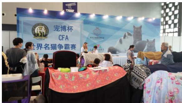
A large banner across the back of the showhall

At the close of the show there was a Best In Show presentation based on our CFA International Cat Show. The two highest scoring kittens, championship cats, and premiership cats were called to a ring. Three of the judges' names had been pulled out of a hat and they each ranked these six cats Best through Sixth Best, the results were mathematically computed and the winners were announced. All six received a large rosette and the top three received money. Best received 5000 RMB which is approximately $725. Best in Show was GC Cat Life Moonface, a silver tabby & white American Shorthair who is the Best Cat in China for the show season that just wrapped up.