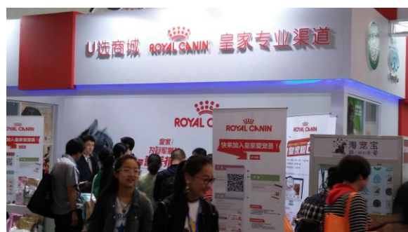
A familiar booth at the Pet Fair