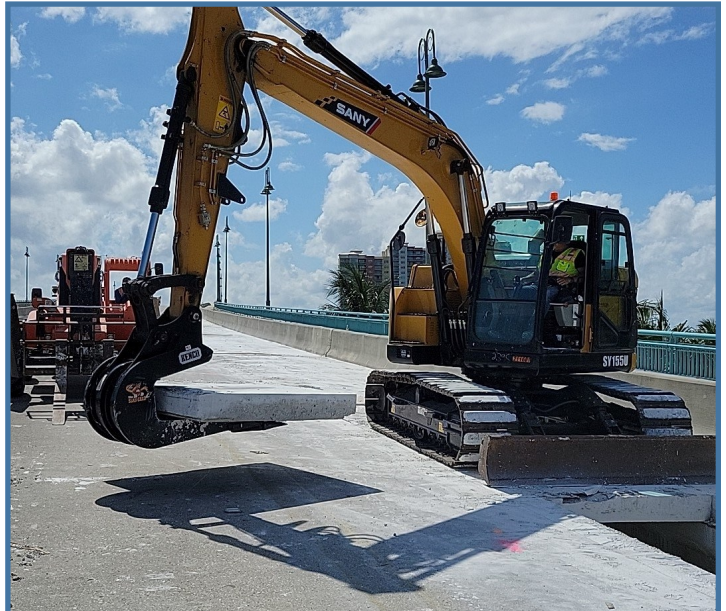
Bridge deck demolition continues. April 2023

Please visit our website: www.d4fdot.com/pbfdot/index.asp