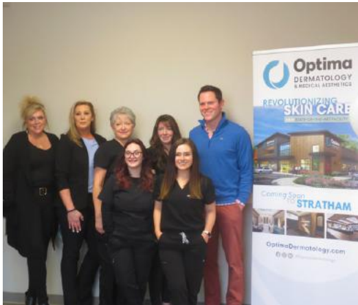
Ribbon Cutting Ceremony: Optima Dermatology