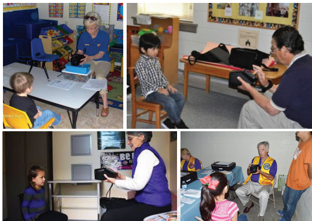
Lions Clubs provide vision screenings and many other services to their communities. What are your projects?