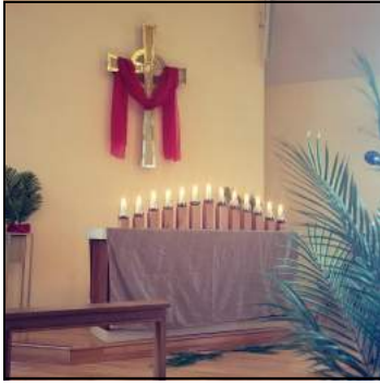
Tenebrae April 5, 2023