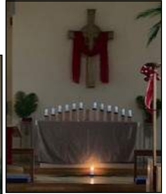
Maundy Thursday April 6, 2023