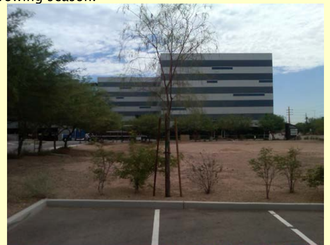
Tree stake, nursery stake, and support ties affecting the trunk taper.