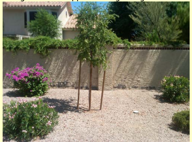
Tree planted with nursery stake still attached after 1 growing season.