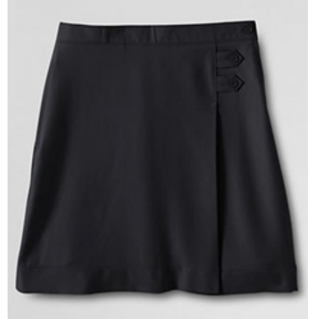
Land's End: Below-the-Knee Pleated Skirt style #430797