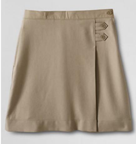
Land's End: Below-the-Knee A-Line Skirt style #430813