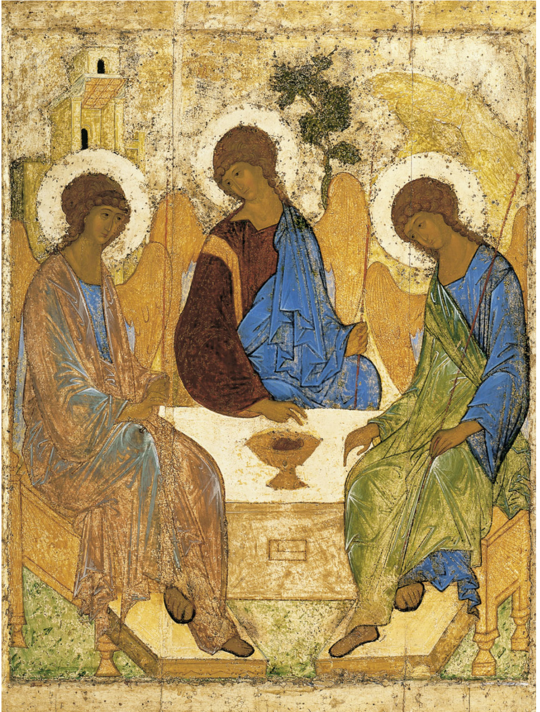
The Trinity , Andrei Rublev, 1411

Service for the Lord's Day | May 31, 2026 | 11:00 a.m.