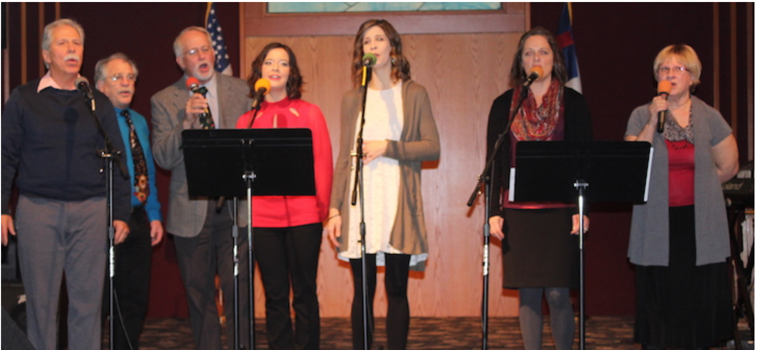
A Blend of Two Worship Teams