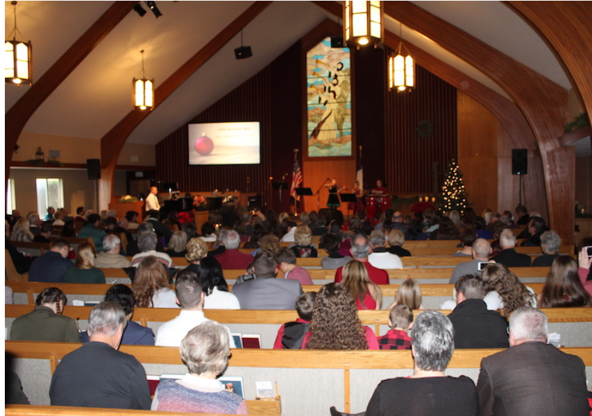
A Beautiful Service for a Full House