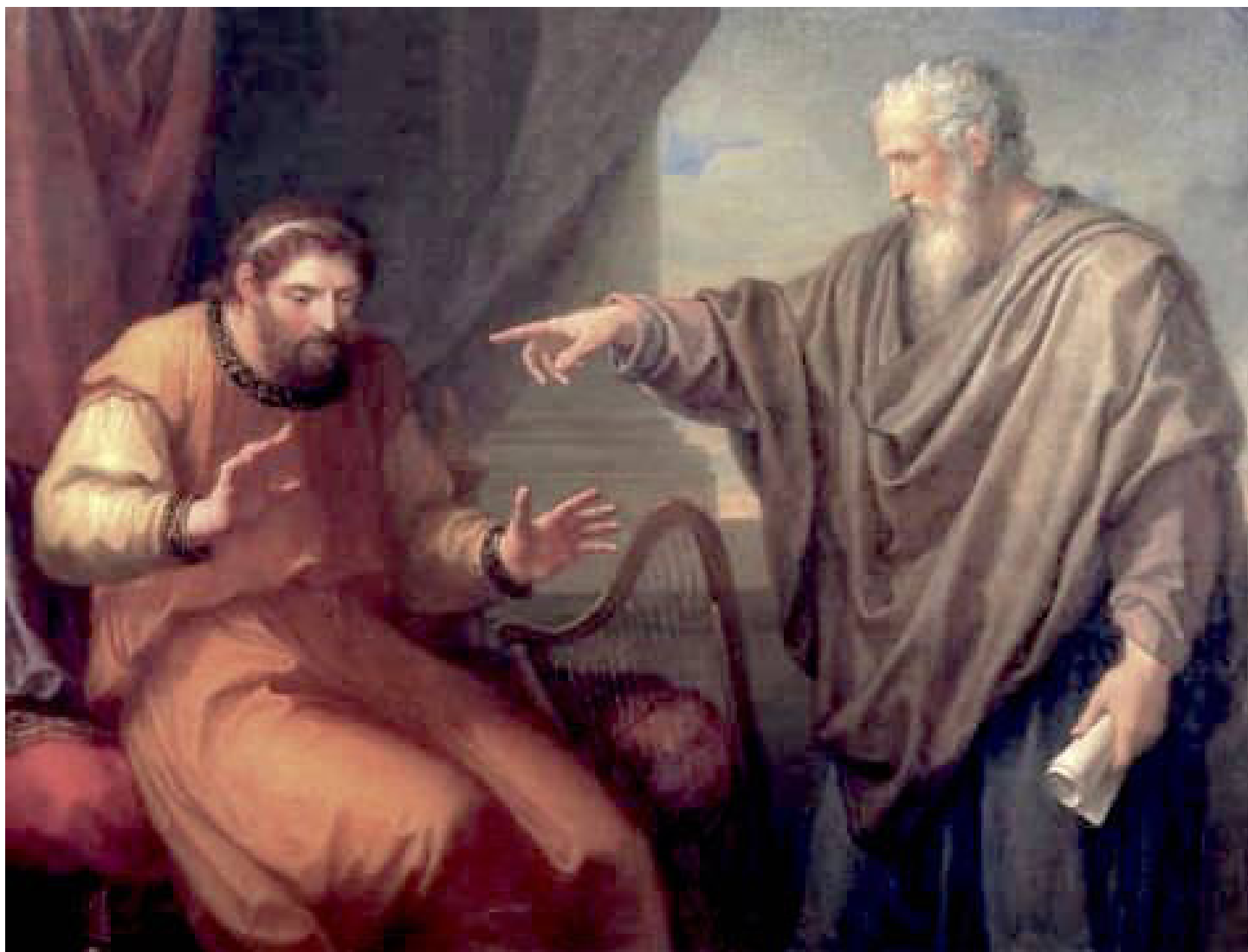
David and Nathan, c. 1797. Kauffmann, Angelika 1741–1807. Oil on canvas, Bregenz, Vorarlberger Landesmuseum.